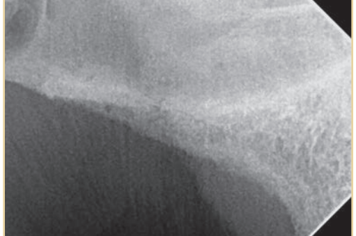
Surgical excision site completely healed 6 months post-operatively. Dental radiograph showing no evidence of regrowth.